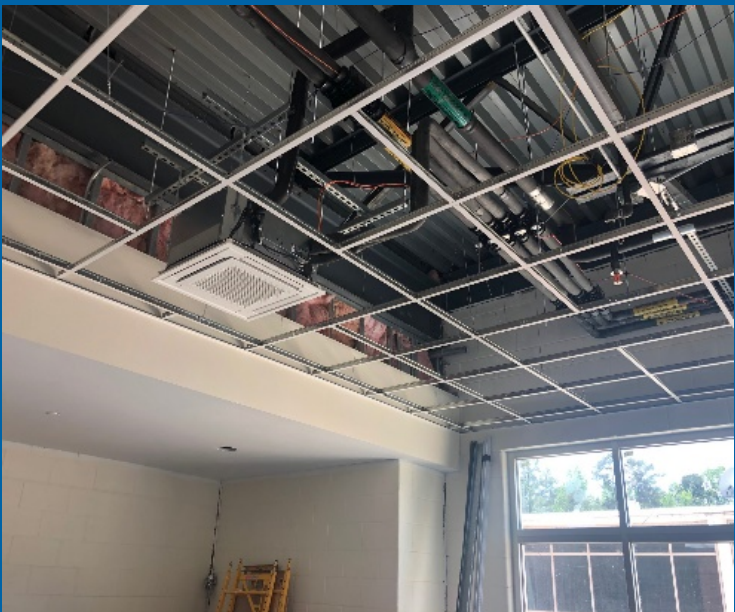
Gymnasium Ceiling Grid and MEP Drops