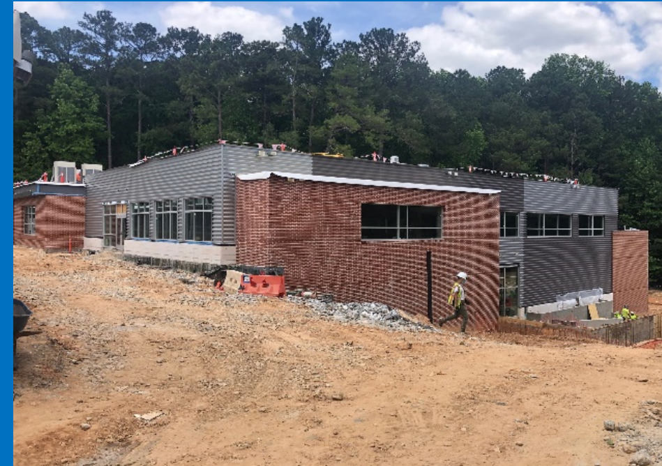
Gymnasium Southeast Elevation Progress