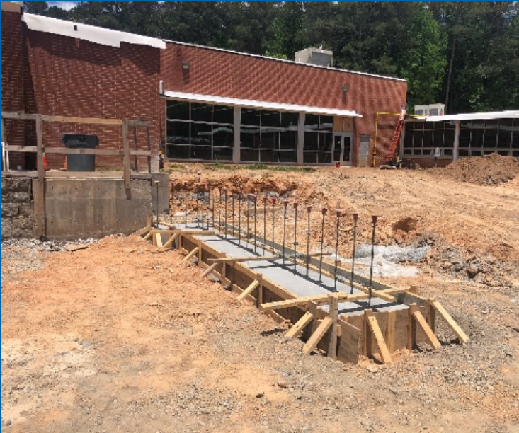
Dumpster Screen Wall Foundations