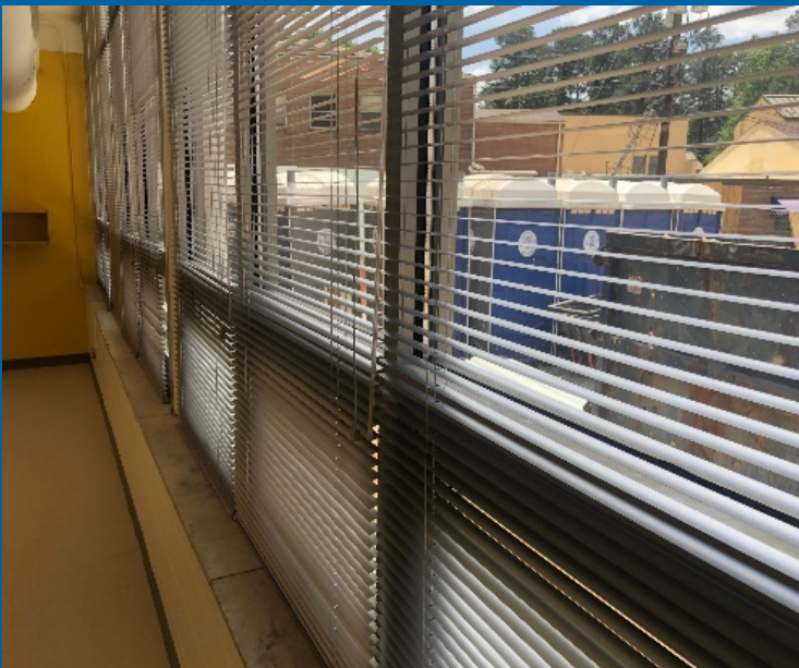
Window Blind Installation