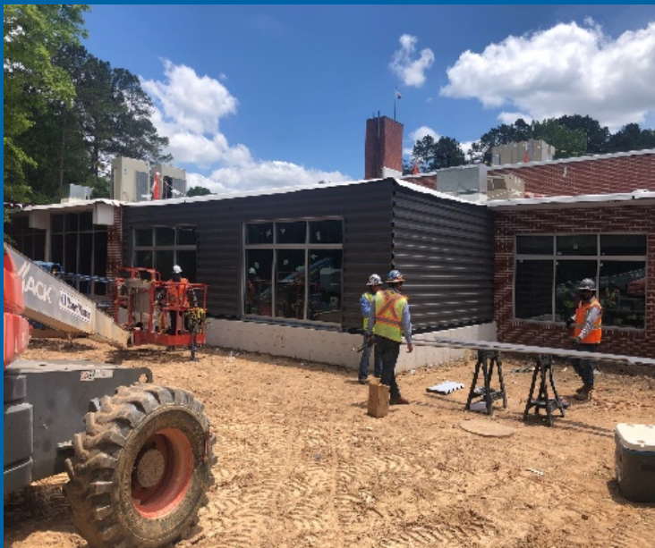
Admin Addition Metal Panels