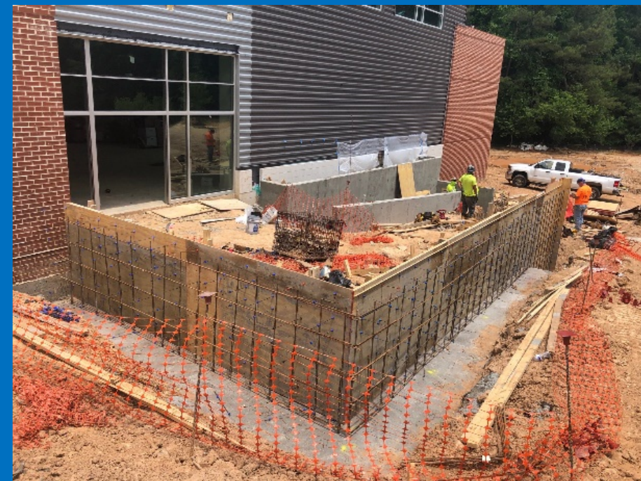
Gymnasium Site Ramp and Stair Concrete