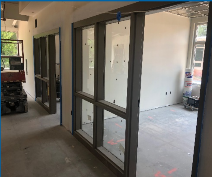
Gymnasium Interior Glass and Paint